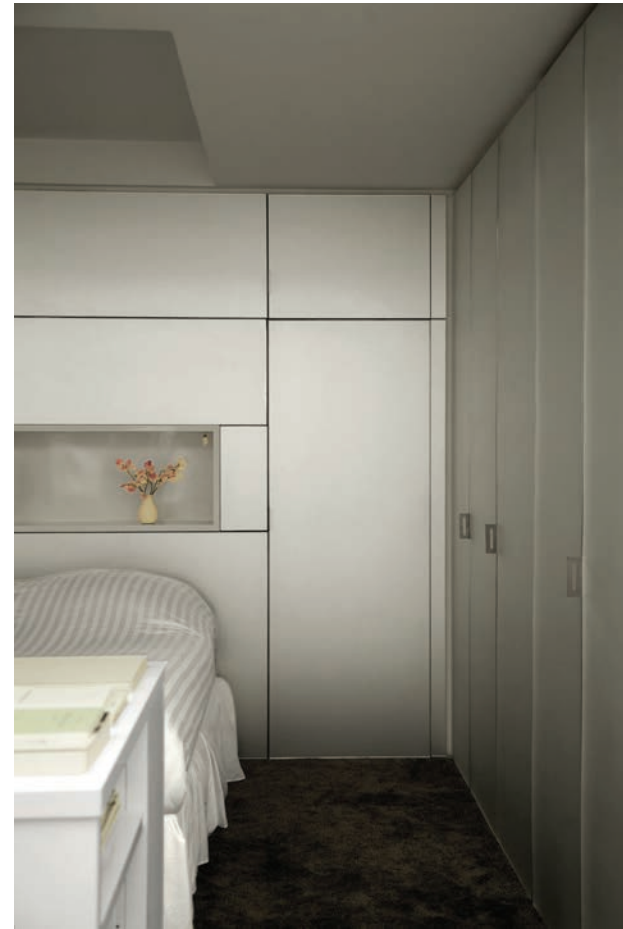
ABOVE RIGHT: A bedroom features built-in storage.