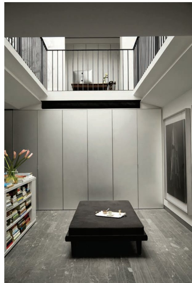
RIGHT: A daybed by Christian Liaigre in the reading room. Artwork by Hiroshi Sugimoto.