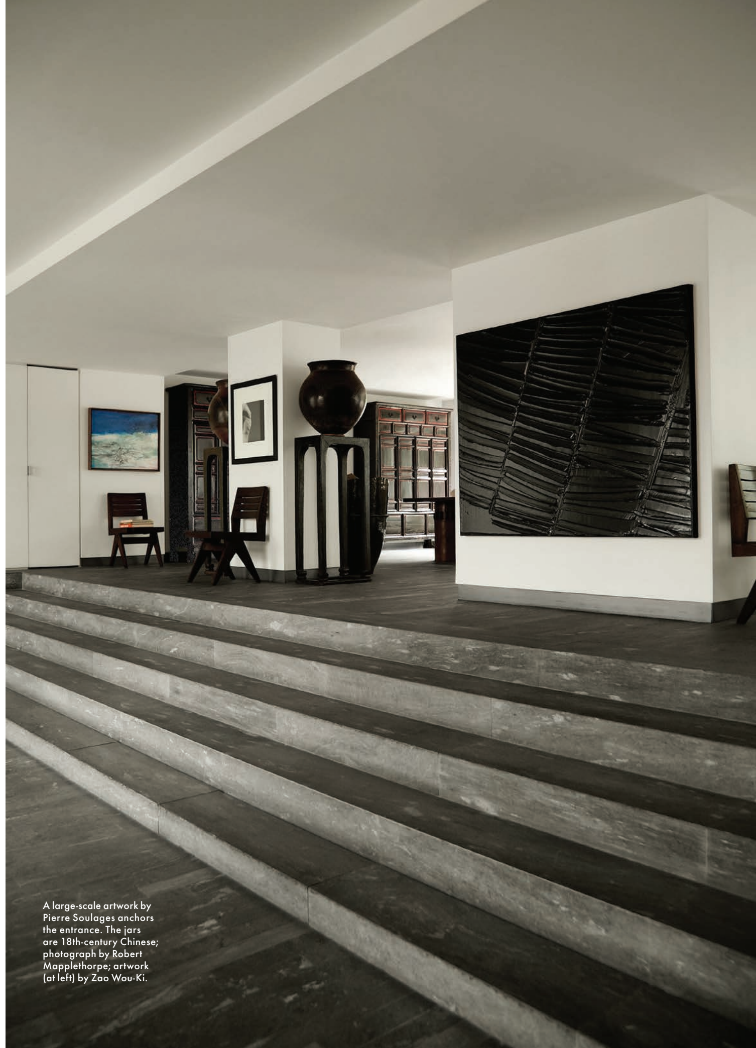
A large-scale artwork by Pierre Soulages anchors the entrance. The jars are 18th-century Chinese; photograph by Robert Mapplethorpe; artwork (at left) by Zao Wou-Ki.