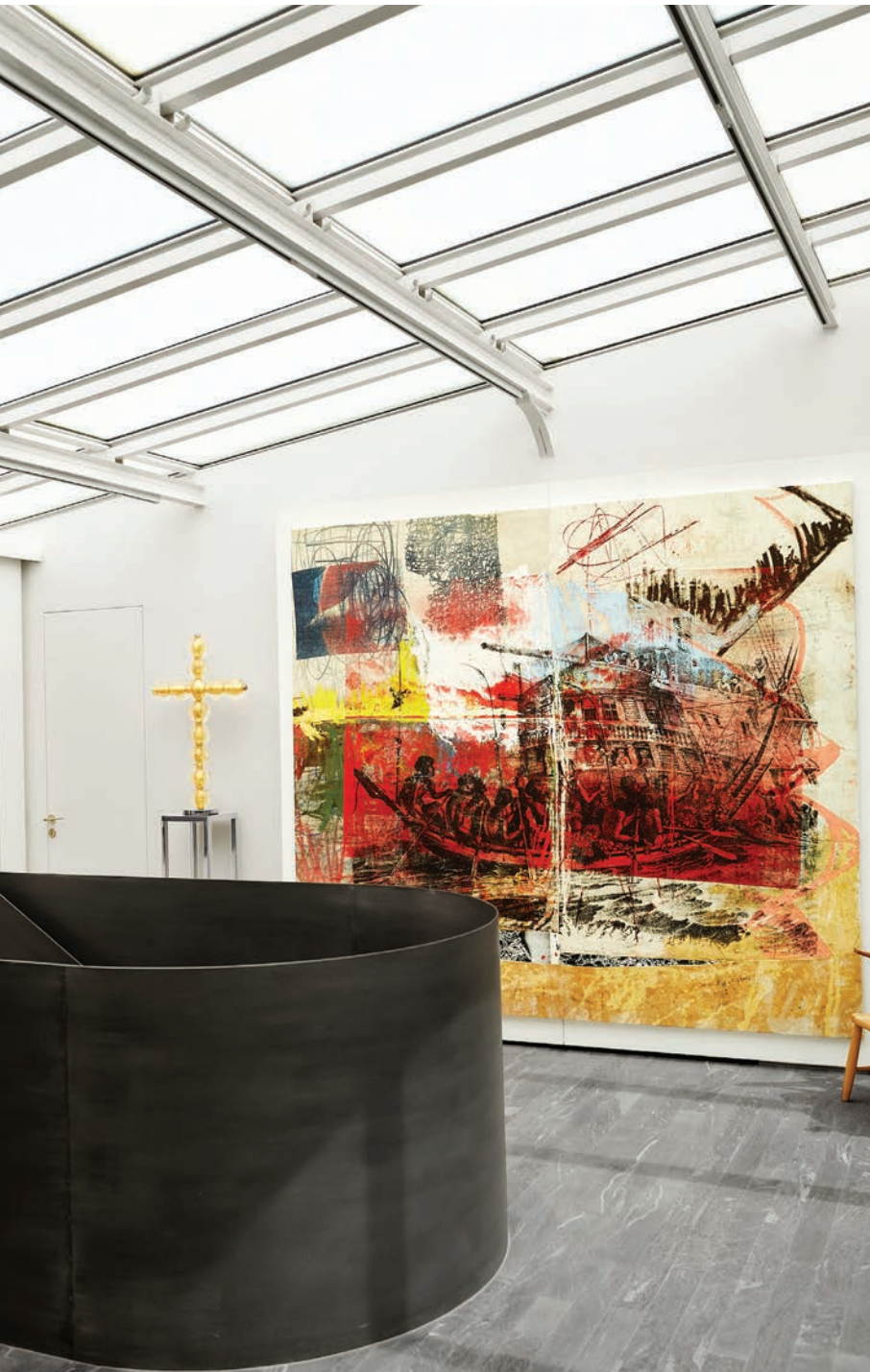
ABOVE: On the top floor, the golden cross is by Jean-Michel Othoniel. Artwork by Oscar Murillo.